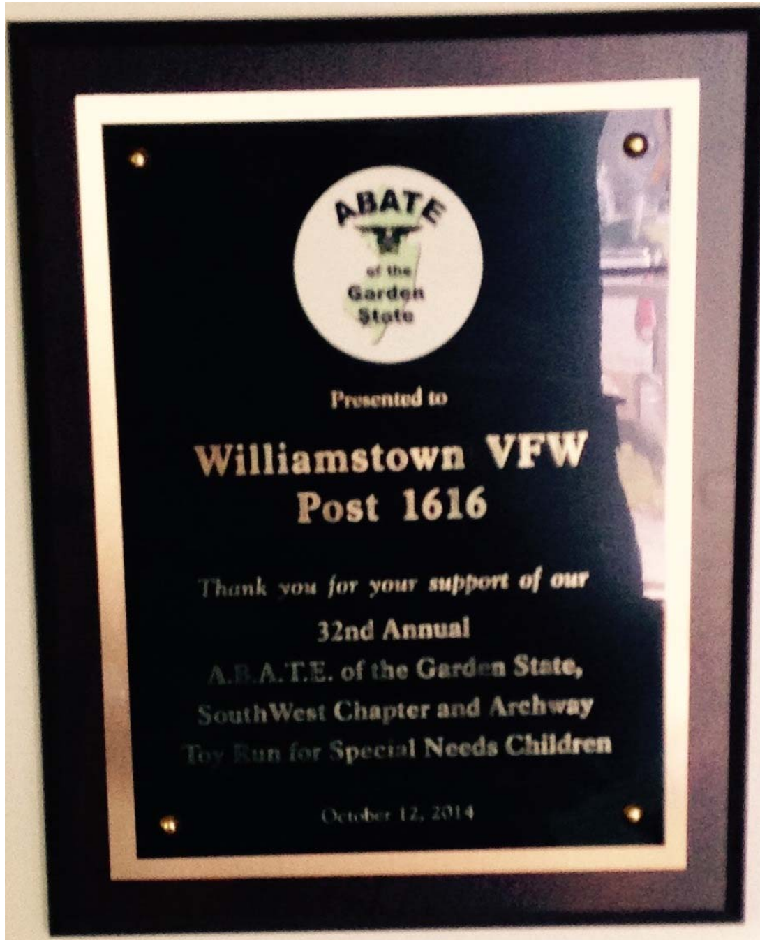
VFW 1616, Williamston Plaque for the 32 nd Annual Toy Run.